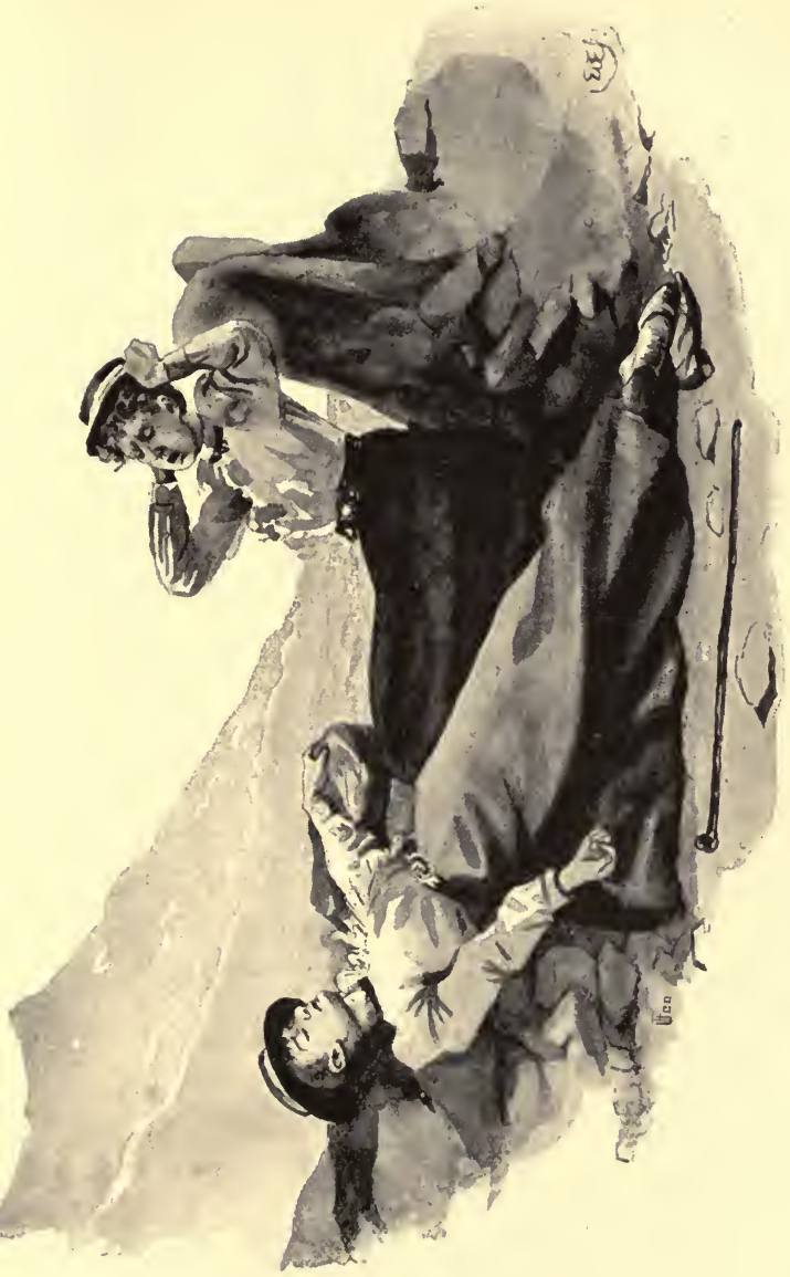
Half-way Miss O' Flannigan extended herself at full length on some contiguous boulders.